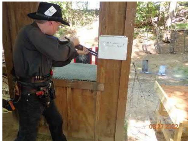
The Hysham Kid